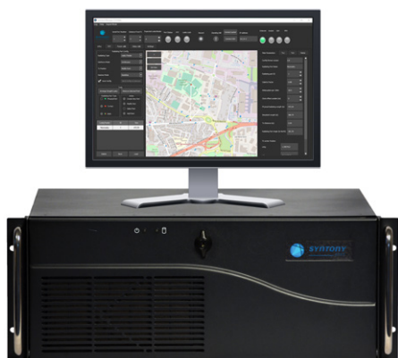
The SubWAVE™ GNSS simulator can be plugged into the telecom network to provide GPS coverage extension

This GNSS coverage extension provides a seamless transition for receivers coming in or out of equipped tunnels, ensuring a GNSS coverage extension to every GNSS-based service (location, navigation, time synchronisation, etc.).